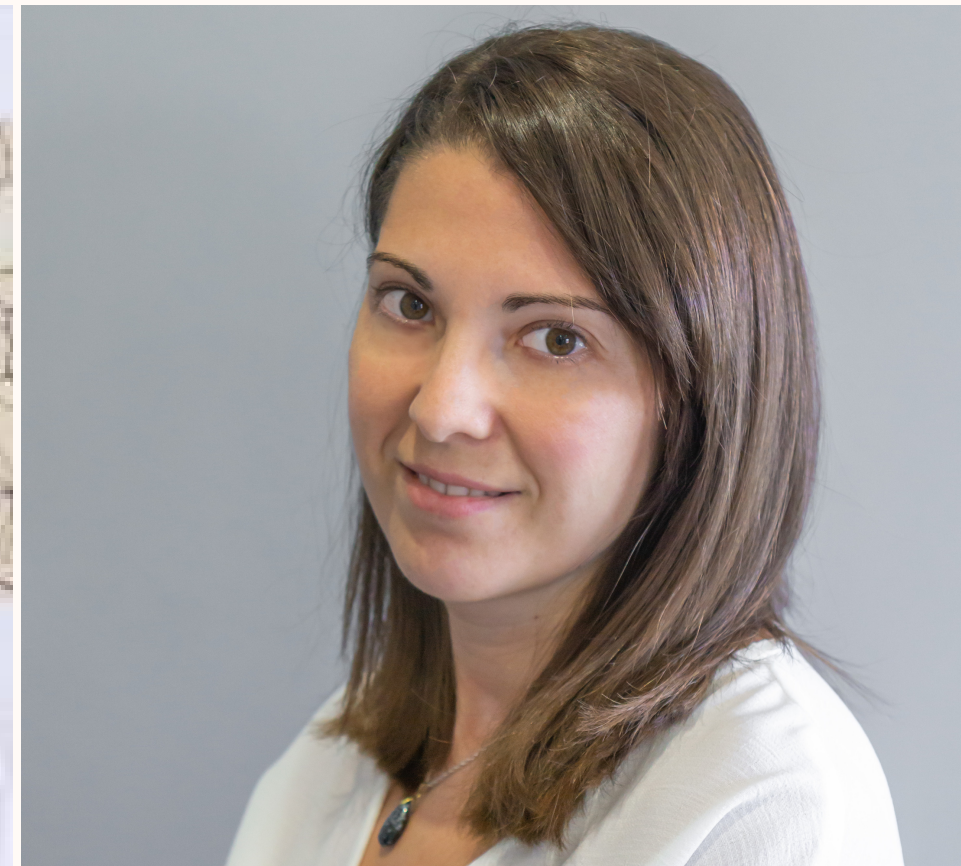
Alicia Alonso Pedagoga